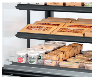
Ultimate product visibility - transparent design, thin shelves, no distraction.