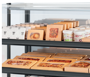
Food (literally) in the spotlights - LED lighting above each shelf.